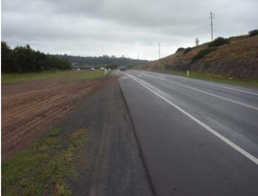
Before: Trucks parking on the side of the road were damaging the edges of the cycle lane and dragging mud and debris onto the cycle lane creating a hazard for cyclists

Council have also taken on our suggestion to provide a sealed area for trucks to park without damaging the cycle lane.