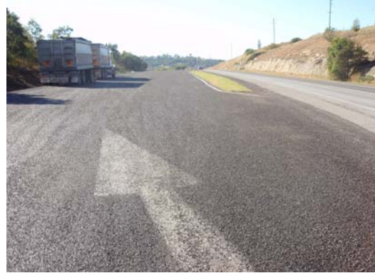
After: Providing a sealed area for trucks to park will reduce the amount of debris on the cycle lane and help protect the edge of the cycle lane from further damage